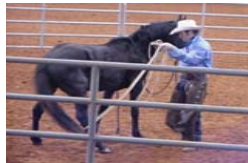
Gentle training methods are always the best.